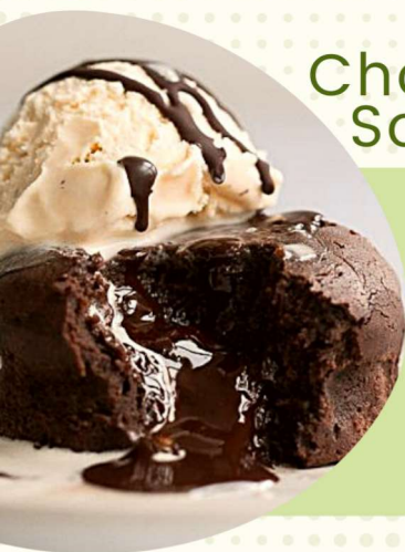
Chocolate Soufflé £7.50

ช็อกโกแลตซูเฟล่ : Rich chocolate dessert with liquid chocolate centre. Served with a scoop of vanilla ice cream.