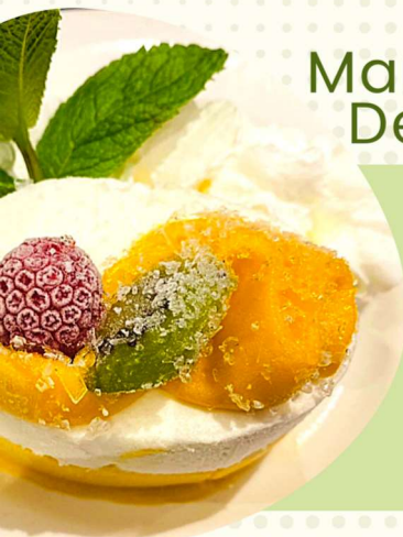
Mango Delight £7.50

แมงโก้ดีไลท์ : Coconut ice cream and mango sorbet with a heart of meringue, topped with raspberry and kiwi slice.